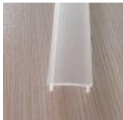
Frosted PC Cover