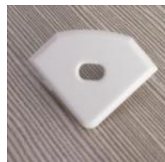
White End caps