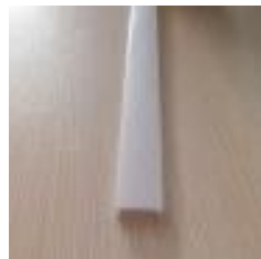
Milky PC Cover