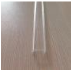
Clear PC Cover

The extrusion is made from high quality Aviation 6063-T5 aluminum alloy with Double-Anodized, and is designed for flexible or rigid LED strips that are 10-12mm wide. One of the accessories offered for the extrusion are covers that shade and protect LEDs inside the profile. There are several cover options: Clear, Frosted, Milky. Covers are made of polycarbonate and are certified for excellent resistance to all weather conditions and UV radiation, as well as being flame retardant. Standard polypropylene end caps and mounting brackets (made from steel with zinc or chrome finish) are used for the extrusion as supplementary accessories. End caps protect the extrusion from dust and other undesirable elements, which can make LED strips dirty and consequently deteriorate the lighting parameters. The extrusion can be mounted to surfaces with the use of double-sided adhesive tape or mounting brackets. The mounting bracket guarantees easy and secure mounting of the extrusion to a desired surface. It can also be used as a connector between extrusions.