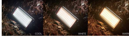
Cool White Warm

ULTRA Bright! ----- LONG Run Time! ----- 3 Mode Color of light changeable