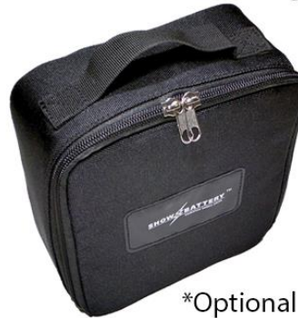
*Optional Storage Pouch