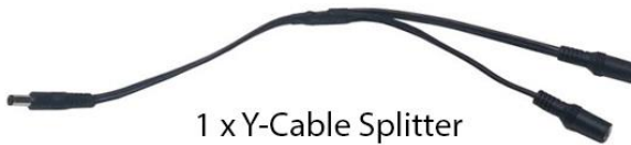
1 x Y-Cable Splitter