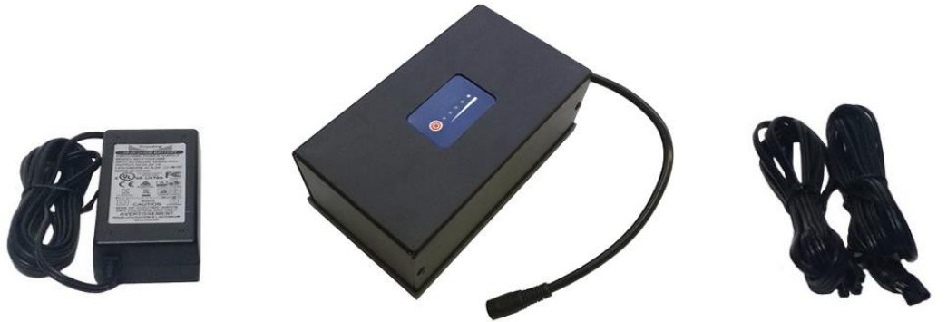
1 x Charger